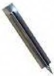
Figure 4: Diabetic Check up